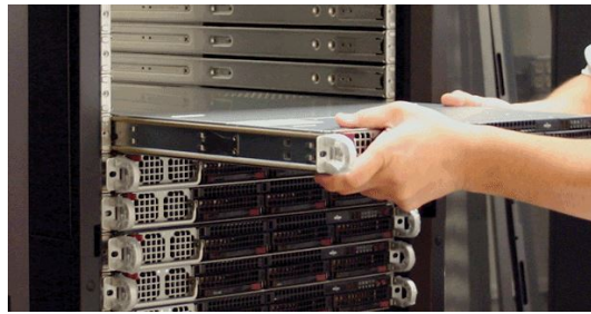
Figure 3. A rack of servers

the other. Because for Google and other companies crunching data for their business, a lot of servers are needed, so gaining on space is a real issue. When many servers are piled up together and put in a big tall box, this is called a rack of servers, and look like this: