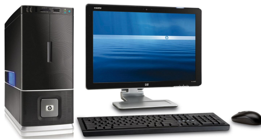
Figure 1. A desktop computer

To understand the cloud precisely, We need first to have a clear vision of what a server is. A server is simply a computer stripped of everything unessential (screen, mouse, graphic card, sound card, keyboard)... To illustrate: when Google is calculating what the best results are for your search "what are cheap and delicious restaurants in Lyon", this calculation must be done on a computer, right? The kind of computer used to do this calculation is not this one: