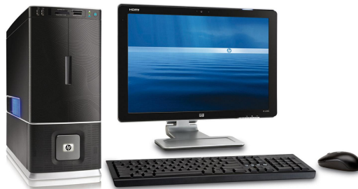
Figure 1. A desktop computer

To understand the cloud precisely, We need first to have a clear vision of what a server is. A server is simply a computer stripped of everything unessential (screen, mouse, graphic card, sound card, keyboard)... To illustrate: when Google is calculating what the best results are for your search "what are cheap and delicious restaurants in Lyon", this calculation must be done on a computer, right? The kind of computer used to do this calculation is not this one: