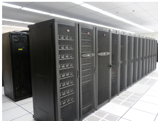
Figure 4. A data center

When all the racks of servers are put in the same room, this is called a data center and looks like this: