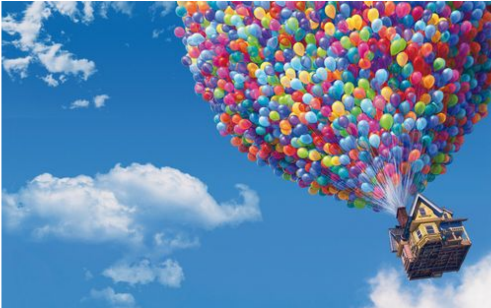
Figure 4. Lots of balloons

How did they handle these balloons in their code? Did they create 20,000 variables and if so, did they just patiently do: