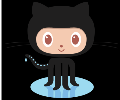
Figure 1. Github's mascot

Github's icon is a cat which is also an octopus: