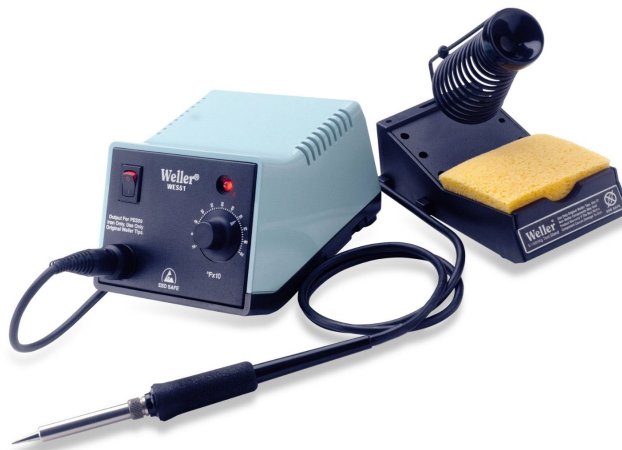
Figure 1. Soldering station

We will also need a soldering equipment: